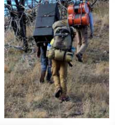
Rocky Mountain YCC high school participants help to complete the bridges on the Lion Gulch Trail